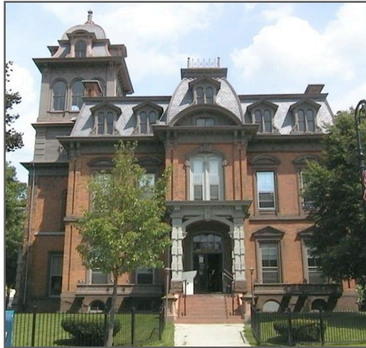
The North Adams Public Library is a model of green building design and the public face of Take Charge.

•There are many events and offers throughout the year that will help us meet our energy challenge, so stay informed!